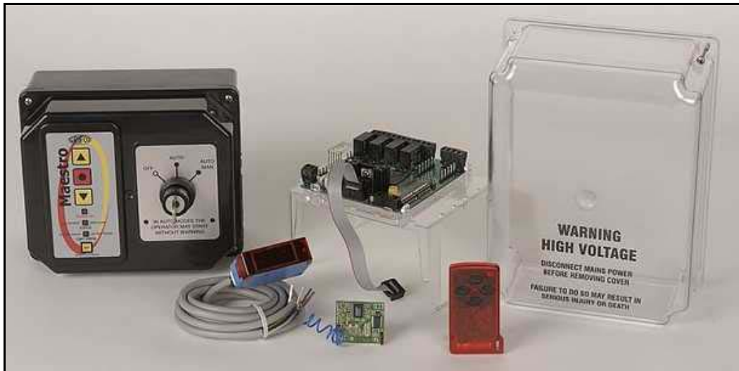
* Elite Kit pictured