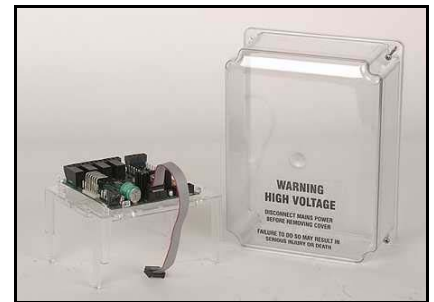
EB1 kit shown complete