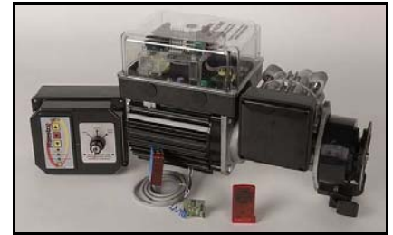
Elite kit shown fitted to Maestro Operator