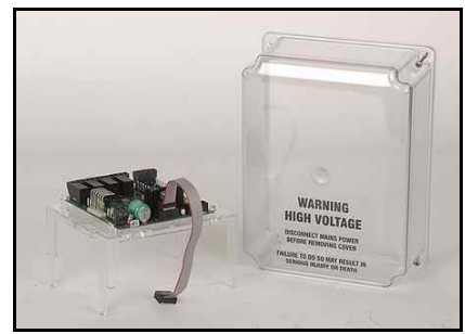
EB1 kit shown complete