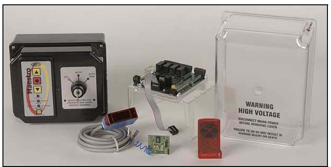
* Elite Kit pictured