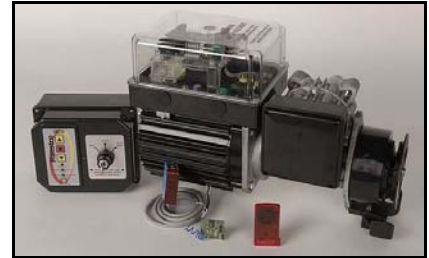
Elite kit shown fitted to Maestro Operator